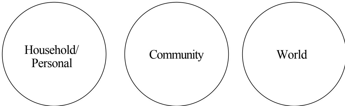
Diagram 2: This is what your poster for Activity 1d) might look like. This poster will be used several times during the course.

Diagram 1: This is what your blackboard might look like during Activity 1, a-c. (The finished diagram should show little sticky notes clustered around the 3 circles also.)